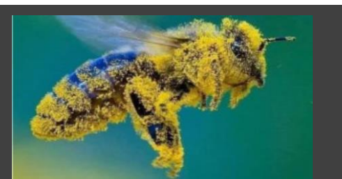
BIODIVERSITY OF THE CITY Students from the Scientific High School "N. Copernico" in Udine, Italy, studied plants and their pollinators in the city. In order to increase the insect biodiversity, they built a simple hotel for insects. Find instructions on how to build a similiar one in their article.